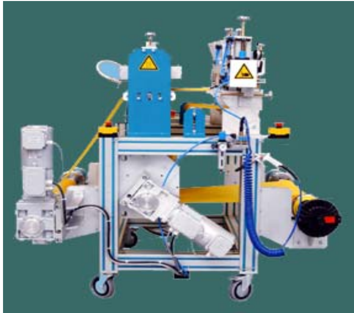
Tablecoater: Entry-level Coating And Lamination Unit

This unit has a working width of up to 500 mm and features the ability to change coating heads in a few seconds.