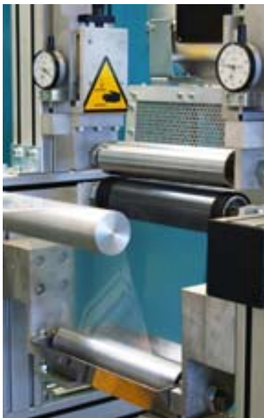
Dipping & Squeezing Units

Coatema is calling this new line "The Starter-Kit." This Starter-Kit program begins with a small swatch coater and ends with a continuous running lab unit with a working width up to 500 mm.