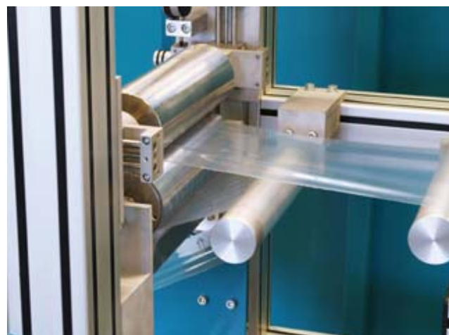
Squeezing Rollers Are Also A Lamination Station